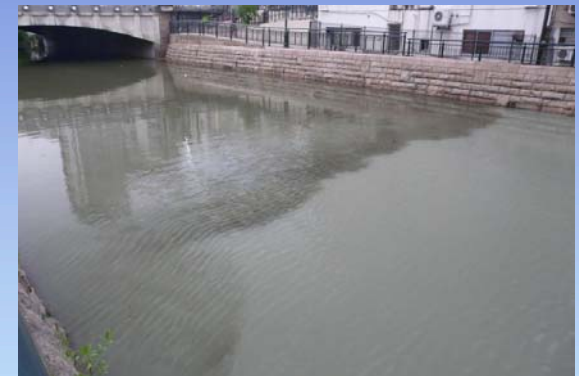
Photo: The Horikawa River (HR), July 22, 2009 (A total eclipse of the sun was observed on the day) This photograph was taken at the Nishiki-bashi Bridge to the direction of Nayabashi Bridge.

The color of the upstream area was “gray yellow green”. Downstream area was “light blue gray (it looked like blue tide)”.