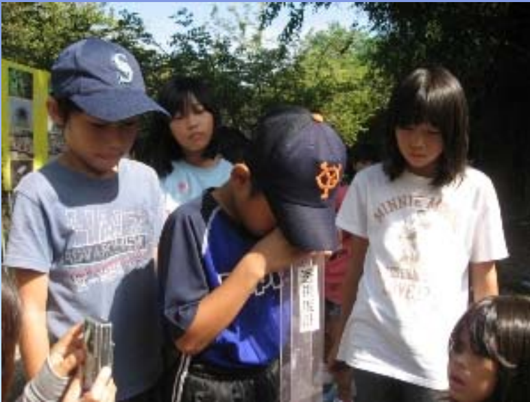
Scene of Transparency Research