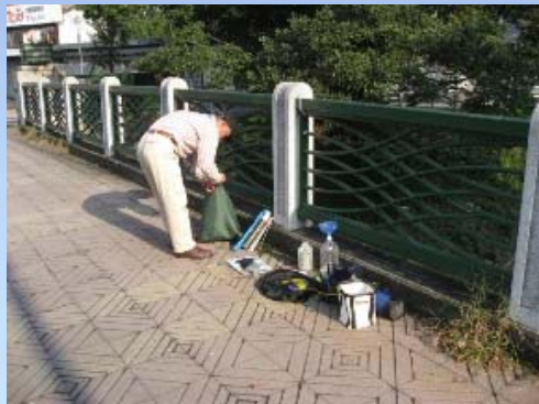
Research by Senior University's Department of Environment