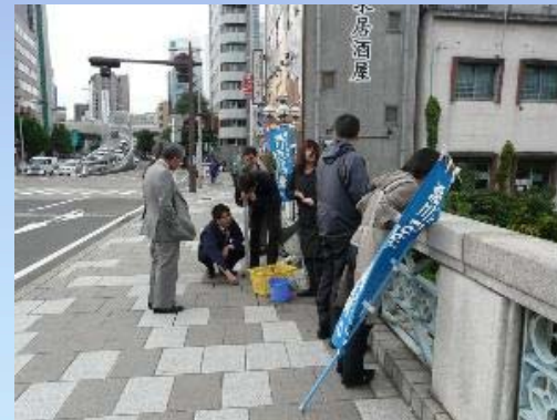
Research by Nakanihon Engineering Consultants Co., Ltd