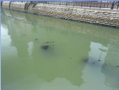
April 15th, 2008 The sludge that come to the surface